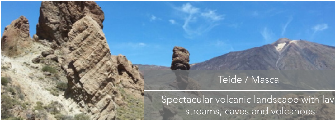
Teide / Masca

Spectacular volcanic landscape with lava streams, caves and volcanoes