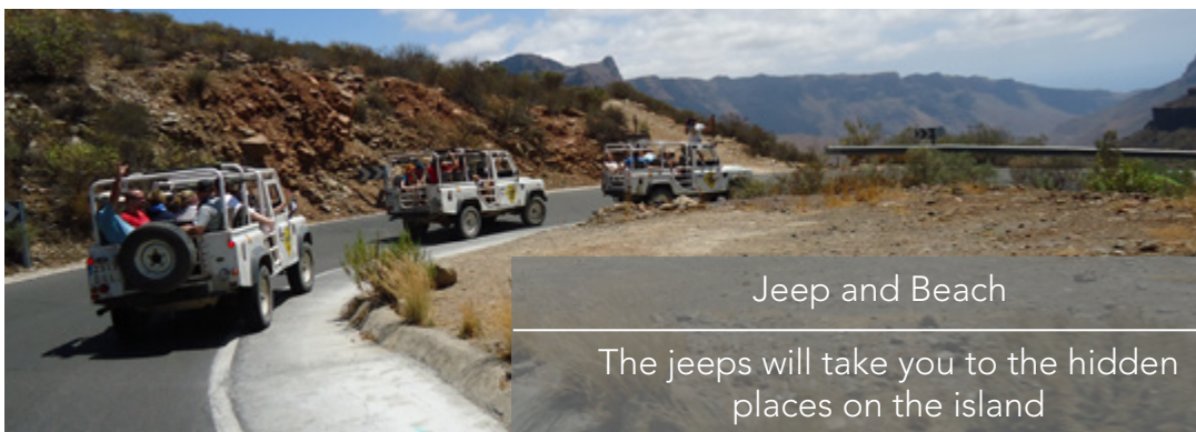
Jeep and Beach

Admire the raw west coast and the peaceful interior of the island. Small sleepy villages and a fascinating landscape is waiting for you. Feel the sand between your feet in the spectacular dunes of Corralejo. Taste homemade goat cheese and try the curing effect of our Aloe plant.